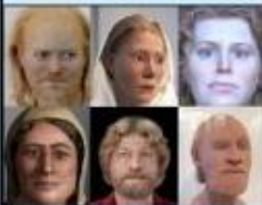
Norse Facial Reconstructions