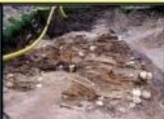
Salme Ship Burial