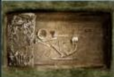
Birka Female Warrior

Info: 306 740-7997 cthauer12@gmail.com judithanderson@shaw.ca