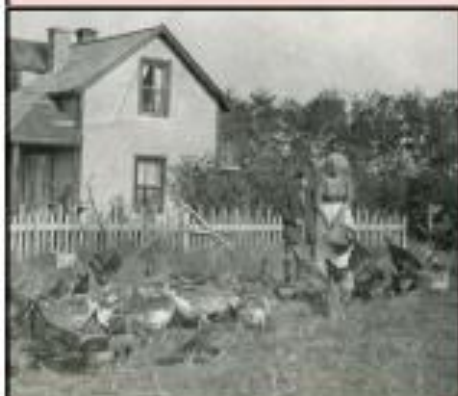
Feed hens. Dig, water, hoe, pick, can...

Join us as we celebrate the lives of Nordic women who created new homes in Canada.