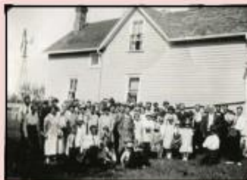
Entertain Minister and Congregation...