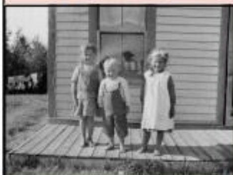
Mind kids. Sew clothes. Hang laundry...